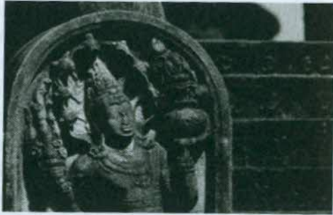
The guard stone with six headed snake at Rathnaprasadaya