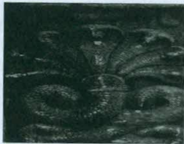
The six headed snake at Abhayagiriya Stupa